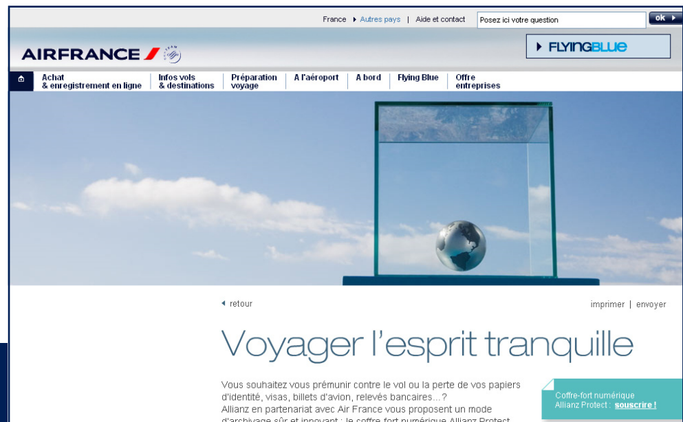
airfrance.com website, section Booking / Other services

At any time, anywhere, customers can organize and manage their online safe deposit box for their own documents or those belonging to a member of their family, they can deposit multiple documents (all file types) from any PC, authorize guests to access their safe and set alarms.